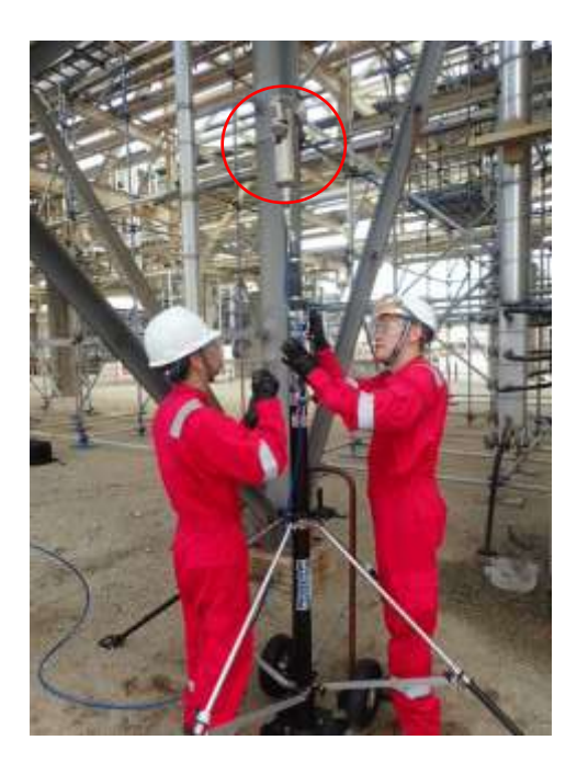
PTZx40 on Telescopic Tower (before extension)

For inspection of pipe supports, the PTZx40 is mounted on a Telescopic Pole or Tower that can be extended and raised up to 9 meters in height. The PTZx40 in this configuration allows for "stand-off" inspections of pipe supports at various heights. The pan, tilt and zoom function allows for inspection of multiple pipe supports in one single vertical deployment. The portable Telescopic Tower can be easily deployed in multiple locations. This increases the efficiency and enables the easy collection of inspection images of pipe supports from multiple angles.