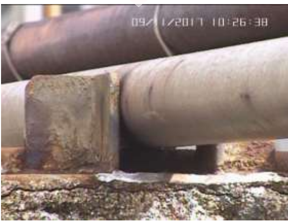
Inspection images: Top shows overview images to give viewer an idea of where the pipe support is located. Bottom shows close-up "zoomed-in" images of the pipe support using powerful x40 zoom.